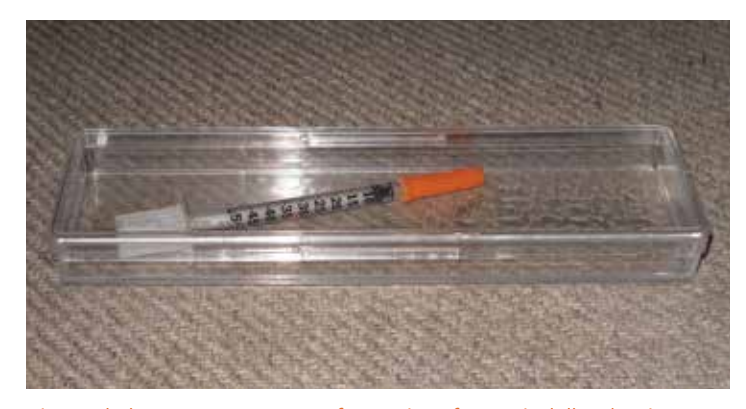
Pictured above: Puncture-proof container from Hindelbank Prison.

With a PNSP in place, authorized injection supplies are not contraband items that need to be concealed, and prisoners are required to keep them in a predetermined spot in their cell, usually inside a puncture-proof container, for example the one pictured here from Hindelbank Prison in Switzerland.