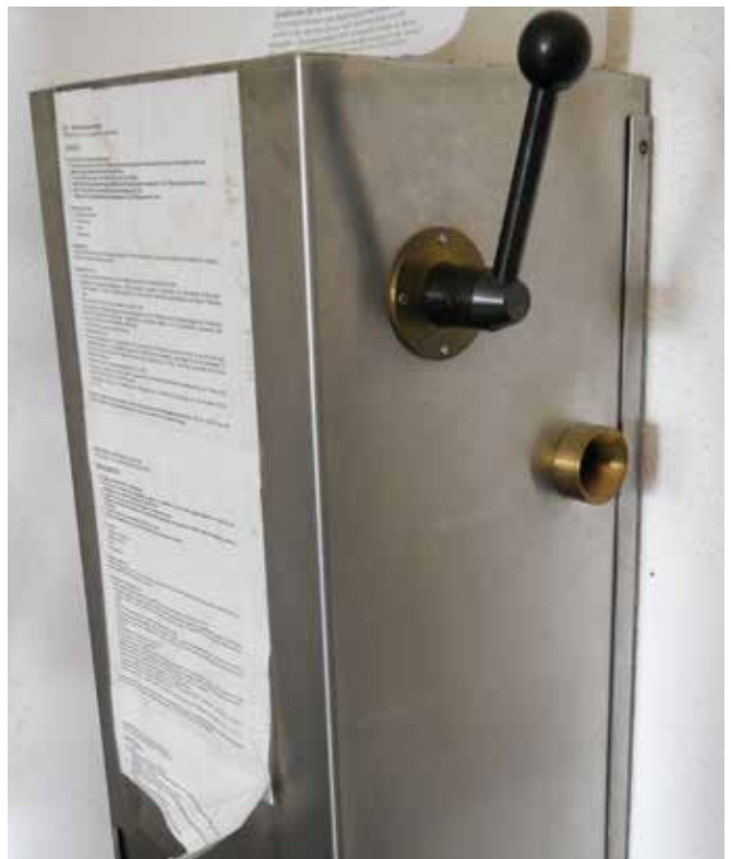
Pictured above: Dispensing machines installed in Hindelbank Prison in Switzerland.