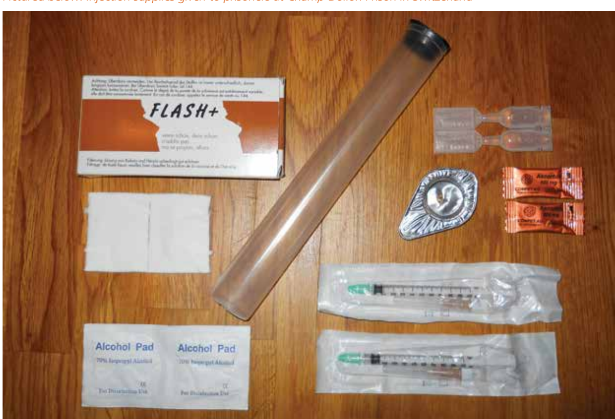
Pictured below: Injection supplies given to prisoners at Champ-Dollon Prison in Switzerland

Regardless of the distribution model, or combination of models, prisoners who are part of the PNSP must typically keep their supplies in a pre-determined location in their cell and injection equipment must stay within the kit or puncture-proof container to help prevent instances of prisoners or staff being accidently pricked by a needle. At Champ-Dollon Prison in Switzerland, for example, prisoners are given injection supplies and a clear puncture-proof tube in which to keep their syringes, pictured here.